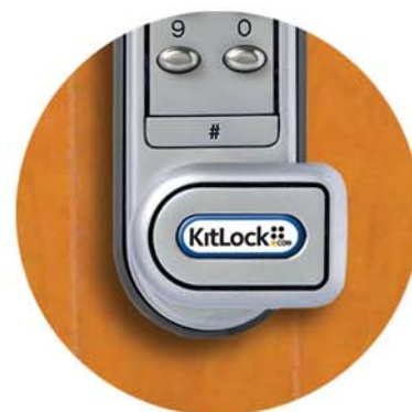
Bottom image Closed position B